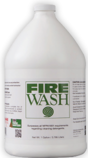
Gallon is shown Available in 4x1 Gallon & 5 Gallon Pail

Fire Wash™ safely and effectively removes toxins, hydrocarbons and other contaminants from your personal protective ensembles.